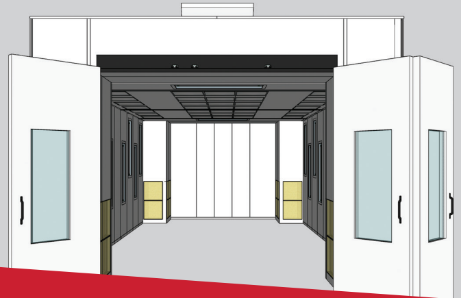
Inside dimensions: 28' 10" x 14' x 9'