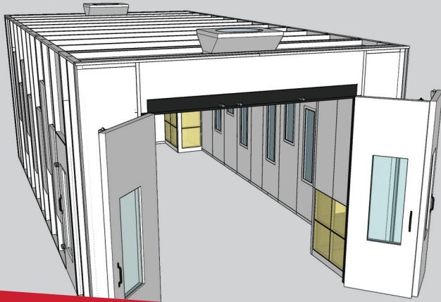
Outside dimensions: 29' 4" x 14' 6" x 11'