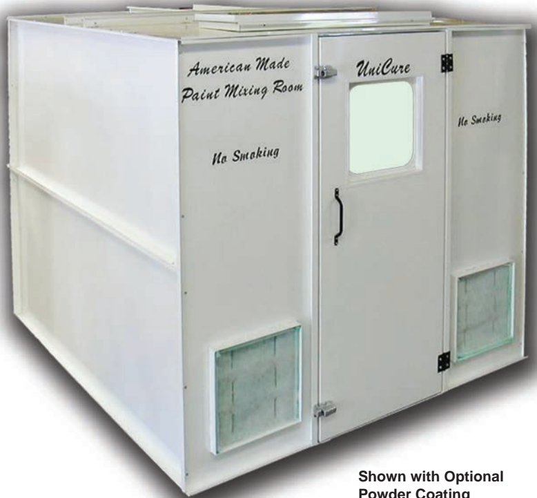
Shown with Optional Powder Coating